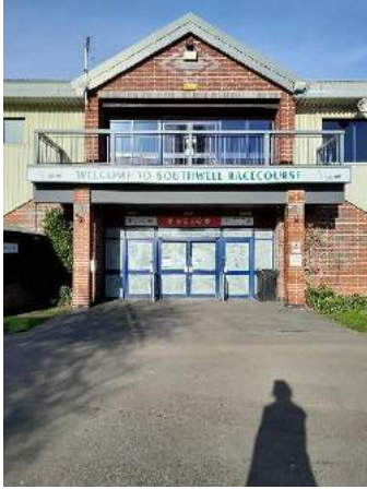
Main Ground Floor Entrance

The main public bars and food outlets at Southwell Racecourse are on the ground floor level, there are a number of level accessible points to this building. For the first floor of the Grandstand there is level access into the building, then level access to the lift which is located just inside the door.