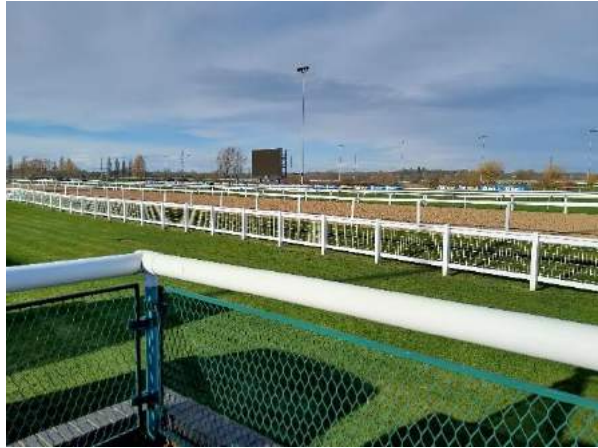
Track Viewing Platform: Entrance Ramp and View