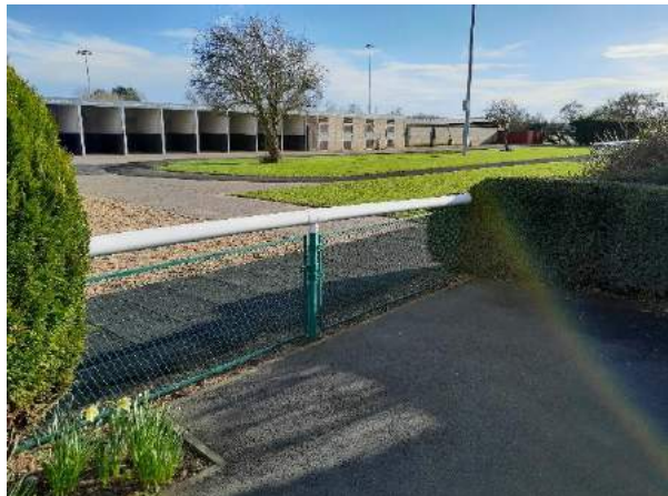
Pre-Parade Ring Viewing Area