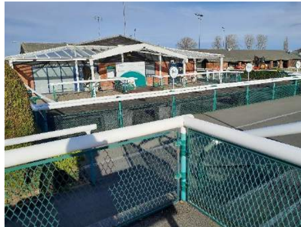
Winners Enclosure Viewing Platform: Entrance Ramp and View