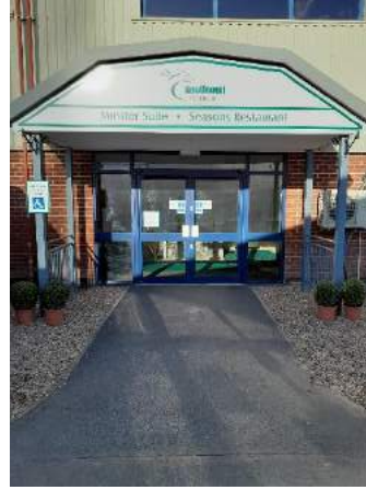
Main First Floor Entrance & Lift Access