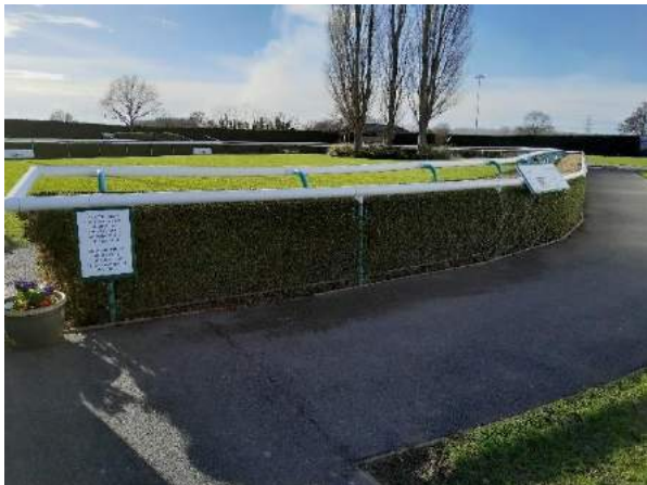
Parade Ring Viewing Area