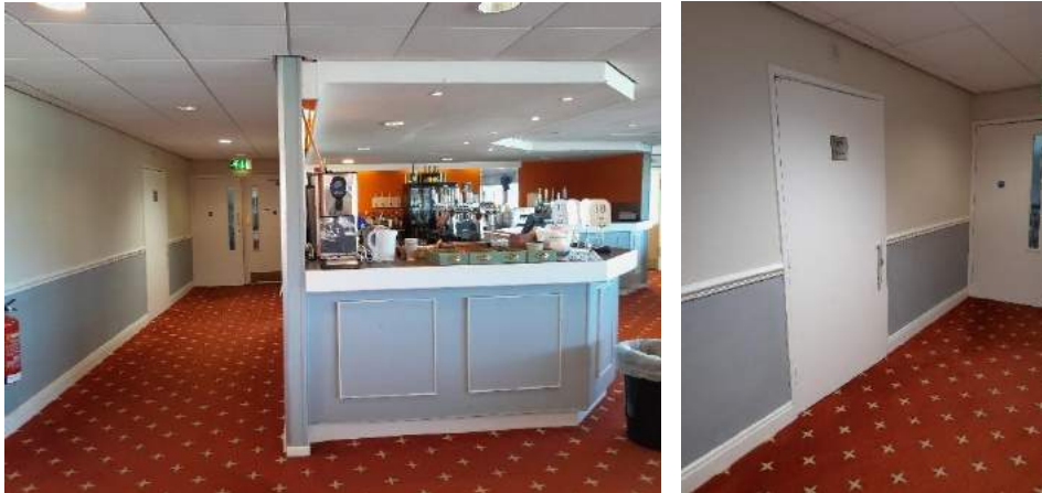
Accessible Toilets: First Floor of the Grandstand (Minster Suite)

We have one accessible toilet situated within the Minster Suite on the first floor of the grandstand, it is located by the main Minster Bar and does not require a RADAR key for access.